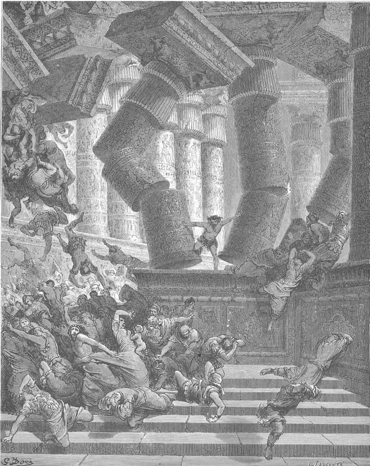
The Death of Samson

Bible Illustration by Gustav Dore — Public Domain