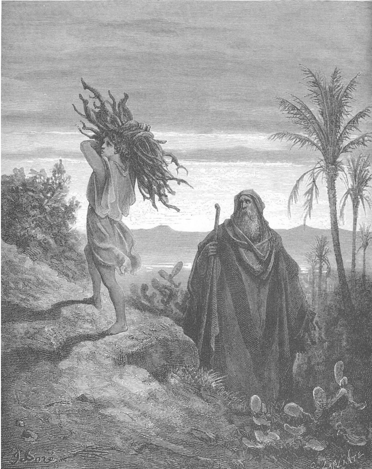
Abraham Offering His Son, Isaac — The Testing of Abraham's Faith

Bible Illustration by Gustav Dore — Public Domain